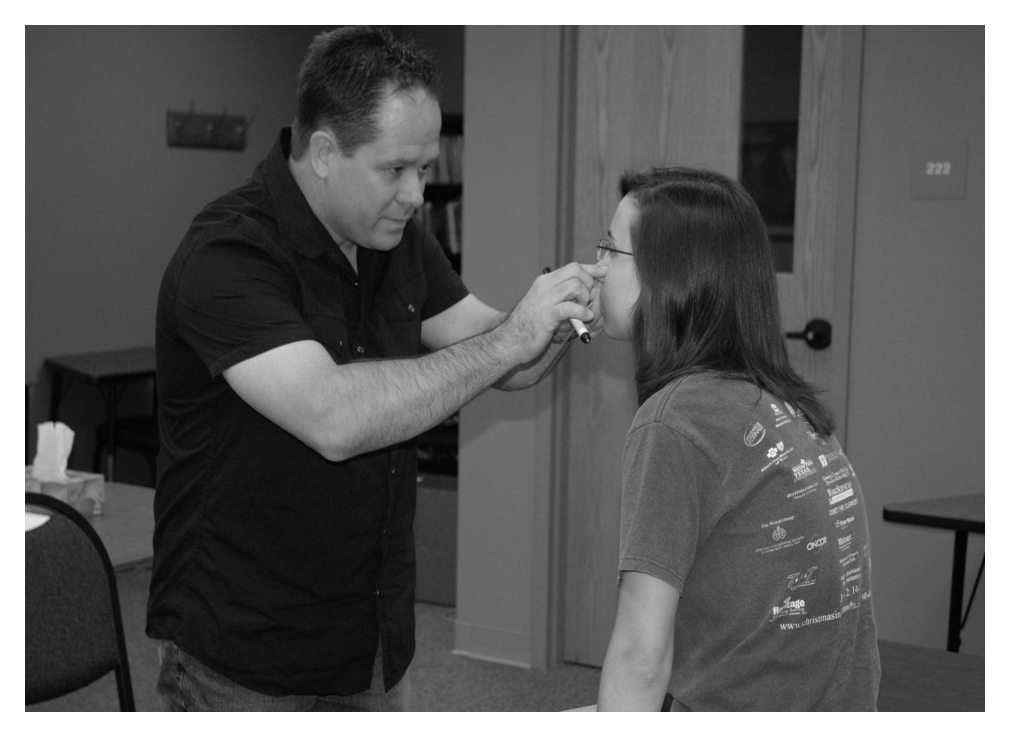
Associate Degree Nursing students practice hands on exercises to learn how to assess medical problems.

When immunizations are required, evidence of the following must be presented to the program coordinator before enrollment in a practicum: tetanus/diphtheria toxoid (ID), varicella measles (students born after January 1, 1957), rubella, and mumps (students born after January 1, 1957). For immunization exclusions, waivers, and acceptable documentation, students should contact the program coordinator.